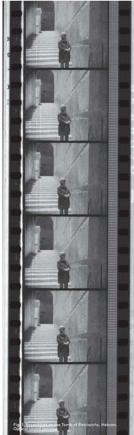
Fig. 1: Rosenblatt at the Tomb of Patriarchs, Hebron. Optical sound positive.

The main problem with the editing of the original film was the lack of its consistency, geographically speaking. Scenes were jumping from one location to another, without any logical pattern. Editor Irit Eshet suggested ordering them according to the text of the opening titles, thus telling the story of former days and of Jewish life in Palestine before the Zionist